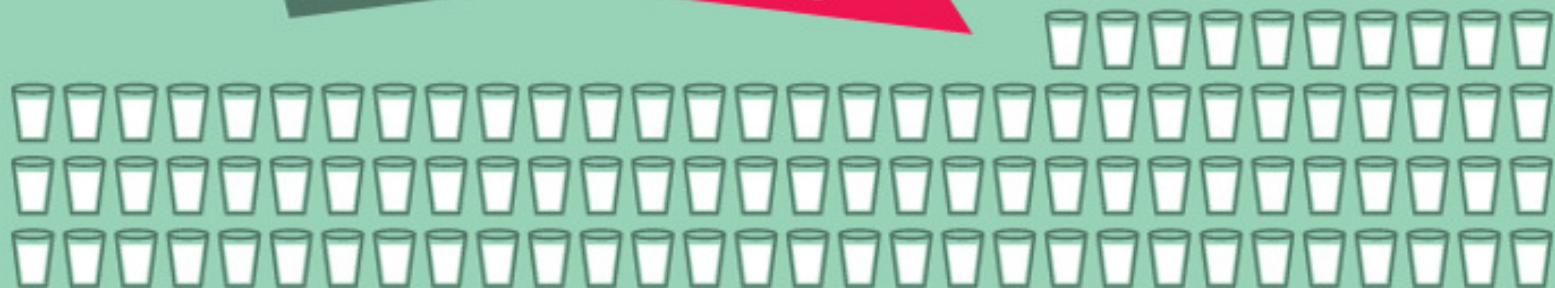
- 3 MILLION

ON CHRISTMAS EVE, Santa visits more than 300 MILLION HOMES. If he enjoys a glass of milk at every stop, Santa consumes an unbelievable amount of milk's 9 ESSENTIAL NUTRIENTS.